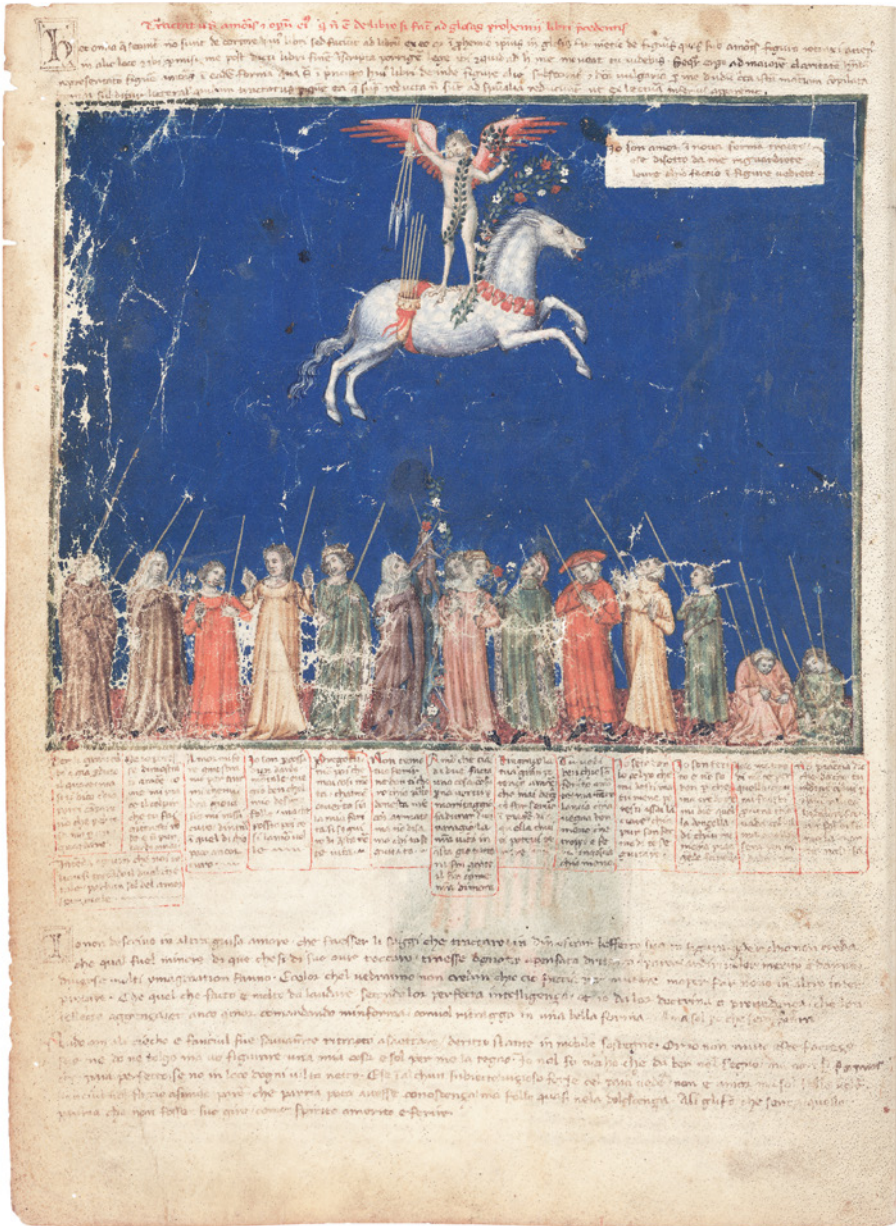
Pl. III: BAV, cod. barb. lat. 4076, fol. 99v: Cupid Awakening the Virtues from their Sleep