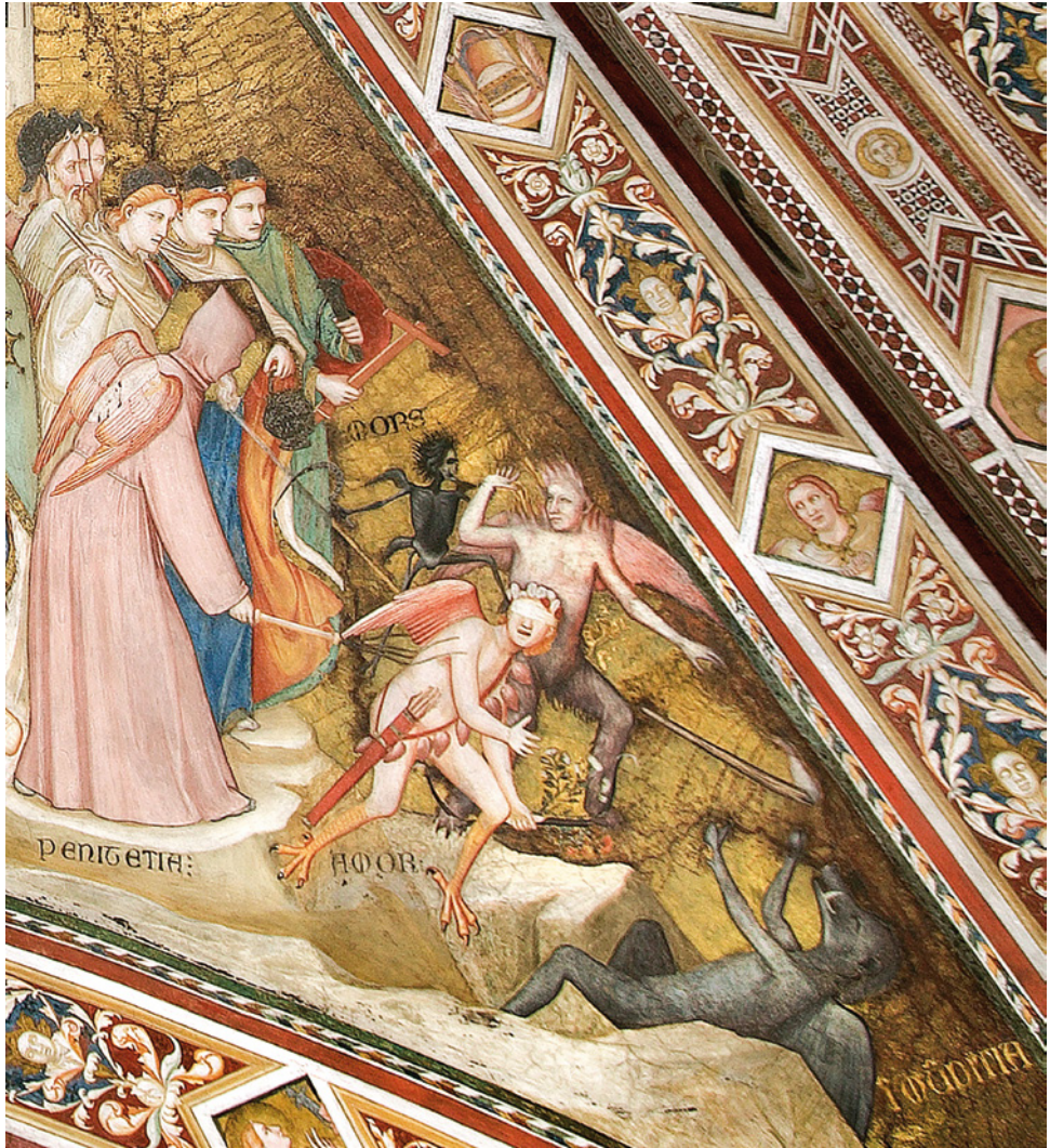
Pl. II: Assisi, San Francesco, lower church, crossing vault: Allegory of Chastity, detail (Stefano)