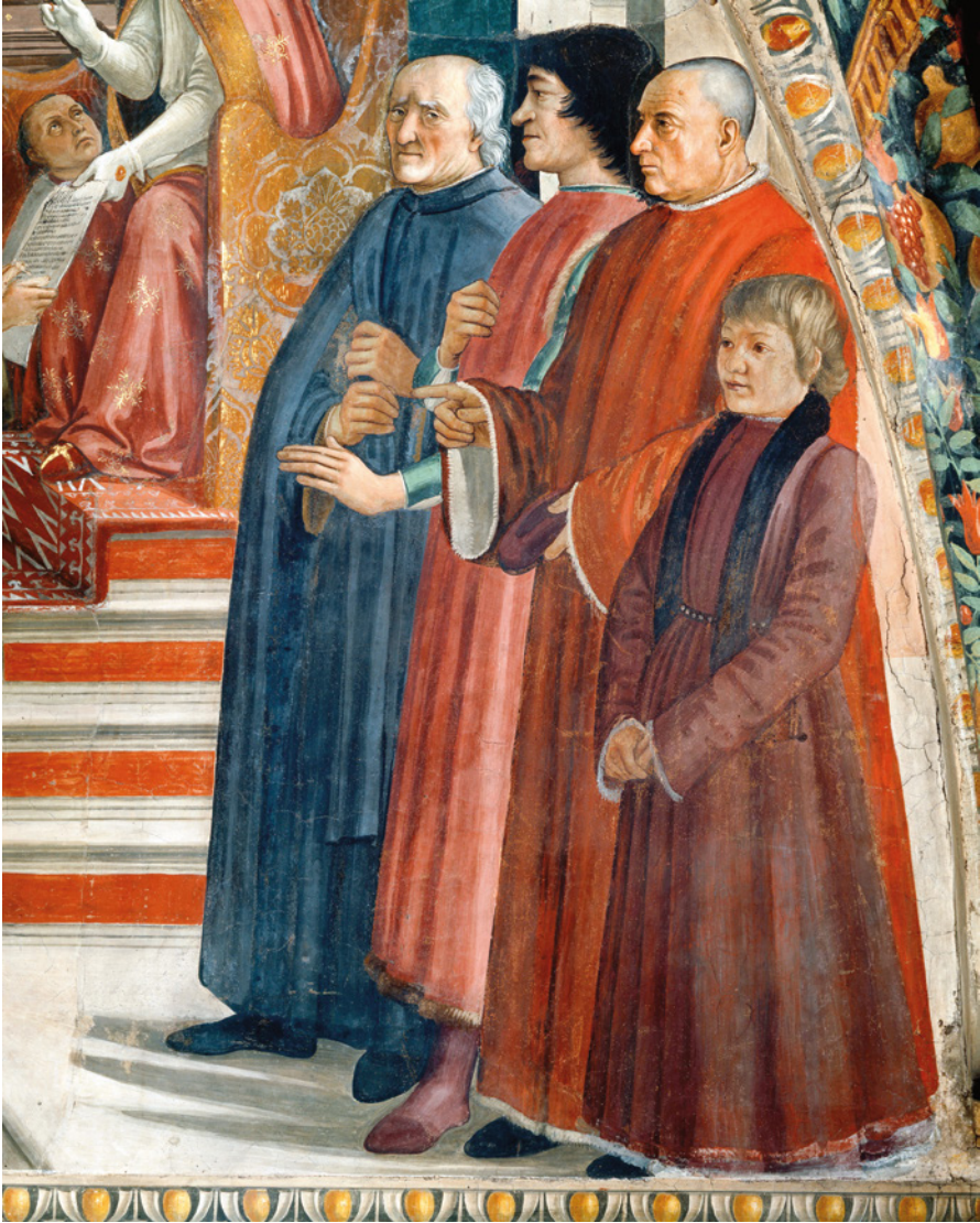
Pl. IX: Domenico Ghirlandaio: The Approval of the Franciscan Rule, detail. Florence, Santissima Trinita, Sasseti Chapel