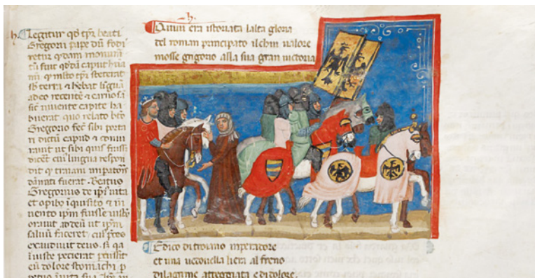
Pl. IV a-c: London, BL, Egerton 943, fol. 80r, 80v, 81r: Divina Commedia, Purgatorio, three examples of humility (Gerarducius)