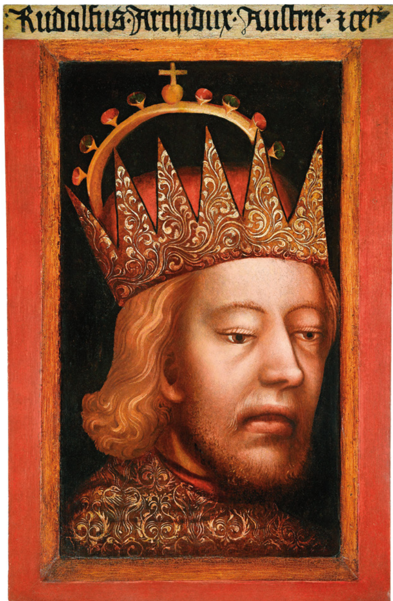
Pl. VI: Vienna, Dom Museum: Portrait of Duke Rudolf IV. (the Founder), 45 x 30 cm