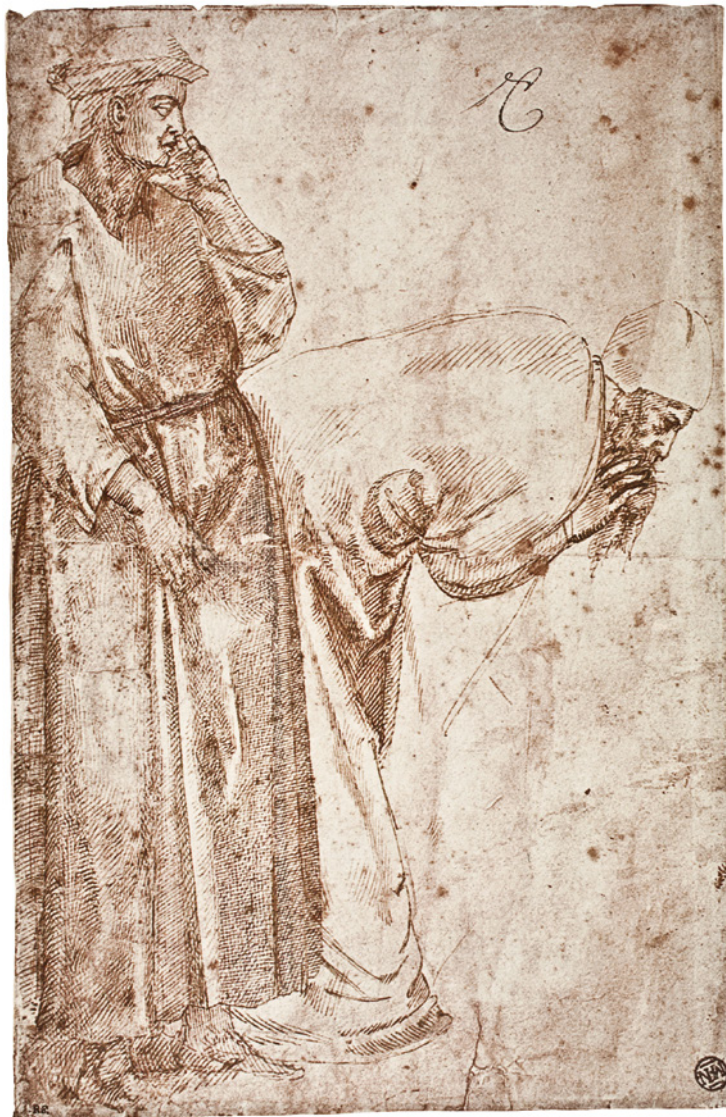
Pl. XVI: Michelangelo, copy after Giotto, Paris, Louvre, 31,5 x 20,6 cm