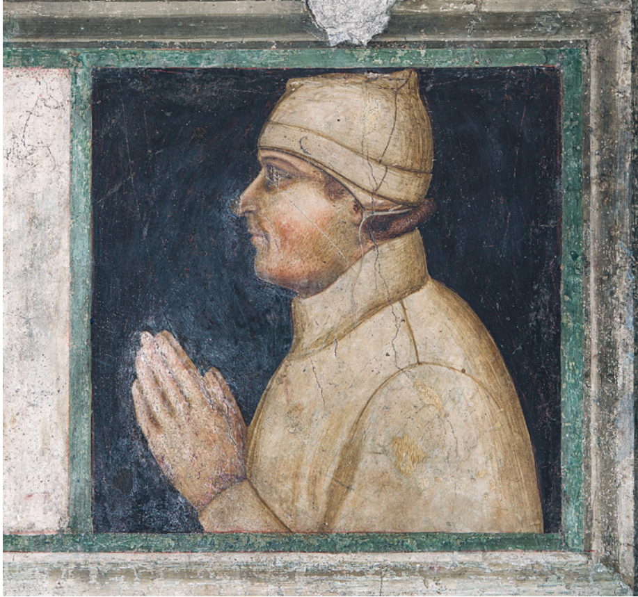
Pl. VII: Assisi, San Francesco, lower church, south arm of the transept, altar of St. John: Portrait of the Founder (Pietro Lorenzetti)