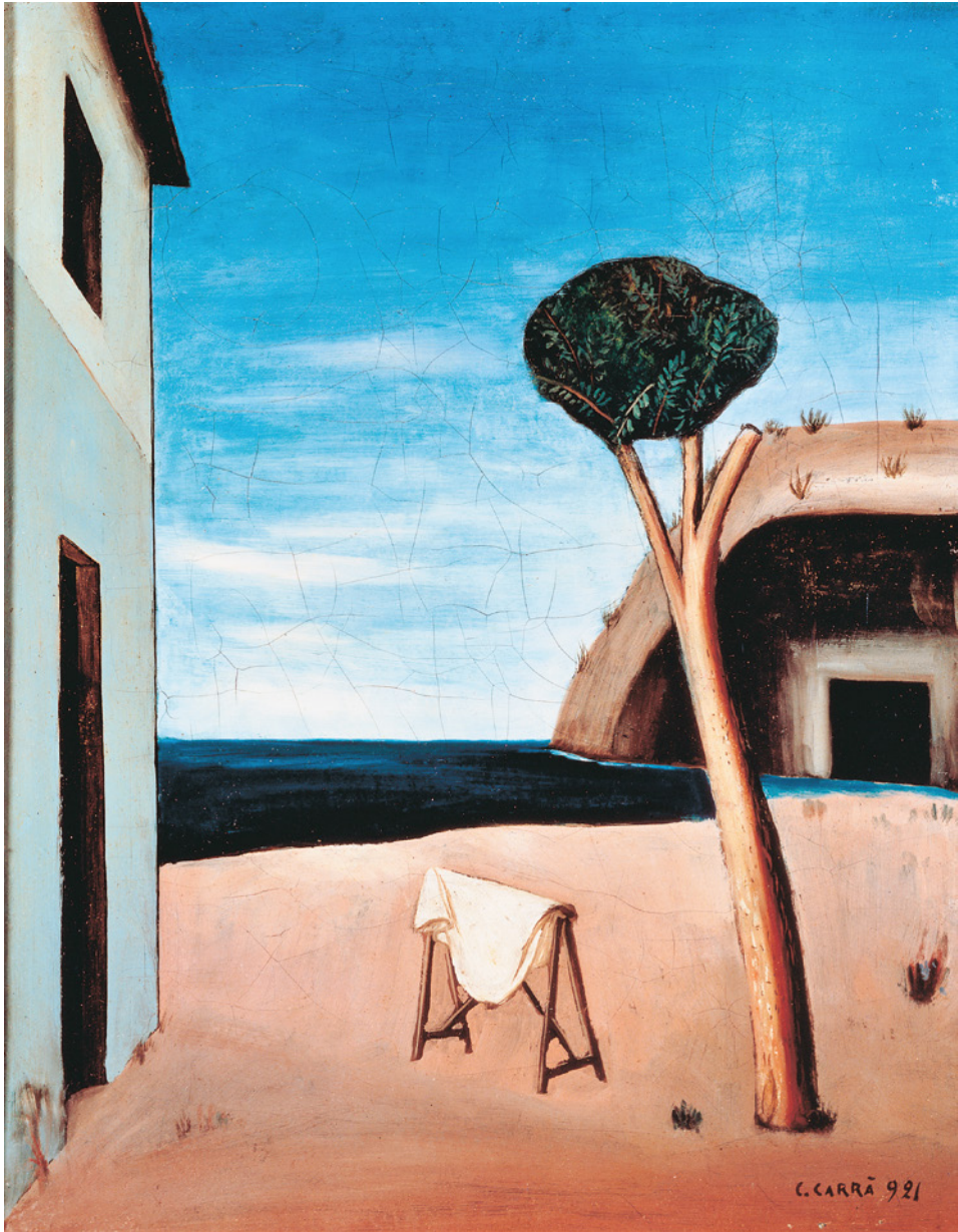
Pl. I: Carlo Carrà: Il pino sul mare, private collection, 68 x 52,5 cm