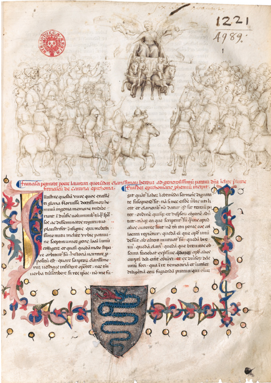
Pl. XIII: Paris, BNF, lat. 6069 F, fol. 1r: Allegory of Glory (Altichiero)