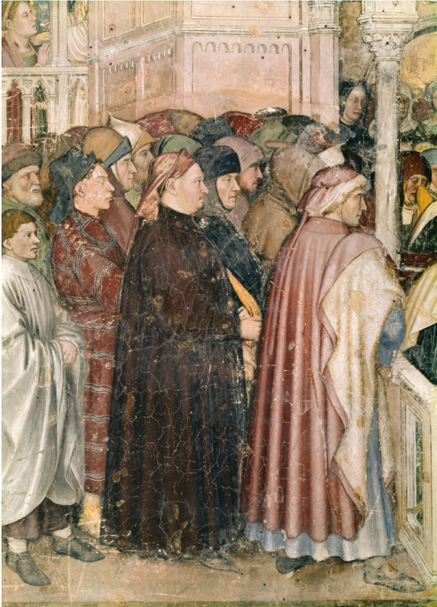
Pl. VIII: Padua, Oratory of St. George: Funeral of St. Lucy, detail (Altichiero)