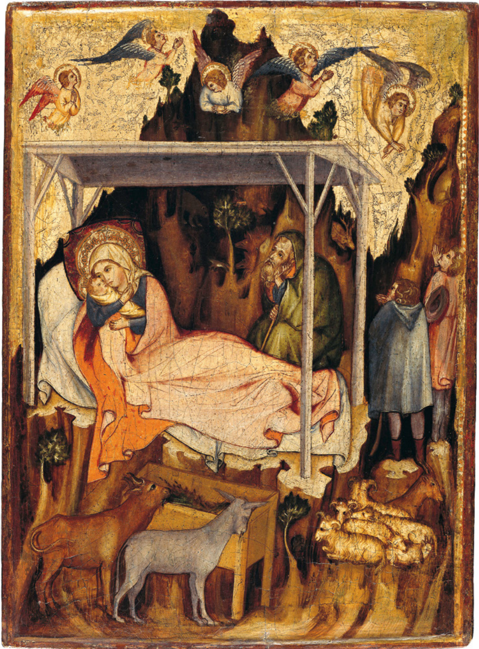
Pl. XV: Berlin, Gemäldegalerie, right wing of a diptych: Nativity of Christ, 33 x 24 cm