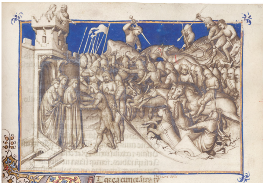
Pl. XII a-b: Dublin, Chester Beatty Library. ms. 76, fol. 1r: Fight between Polynices and Tydeus; fol. 85r: Antigone on the City Wall, Polynices talks to Iocaste, Hunting the Tigers, Battle, Amphiarus is Swallowed by the Earth (Altichiero)