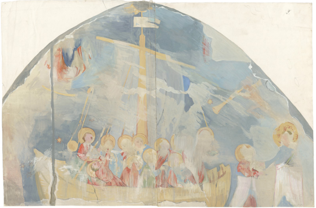
Pl. XIV: Strasbourg, Archives municipales: watercolour copy after the Navicella in Saint-Pierre-le-Jeune before its restoration