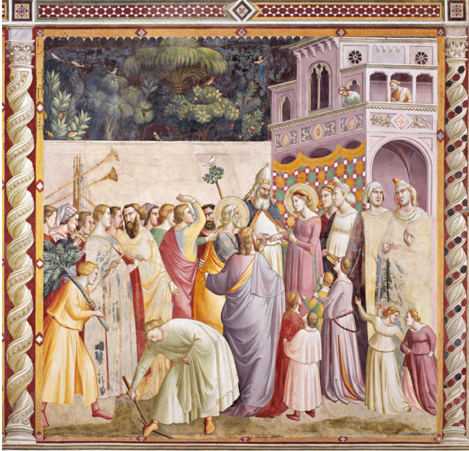
Pl. XI: Florence, Santa Croce, Baroncelli Chapel: The Marriage of the Virgin (Taddeo Gaddi)